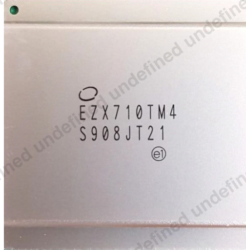
Figure 1-1. Example Component with Identifying Marks